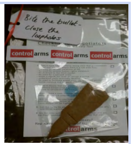
Ammunition given to delegates during the March conference.

Before the UN Conferences in July 2012 and March 2013, the Japanese Delegation collaborated with the ICRC and NGOs to ensure that the treaty would be robust and effective. The Japanese Delegation convened numerous meetings between